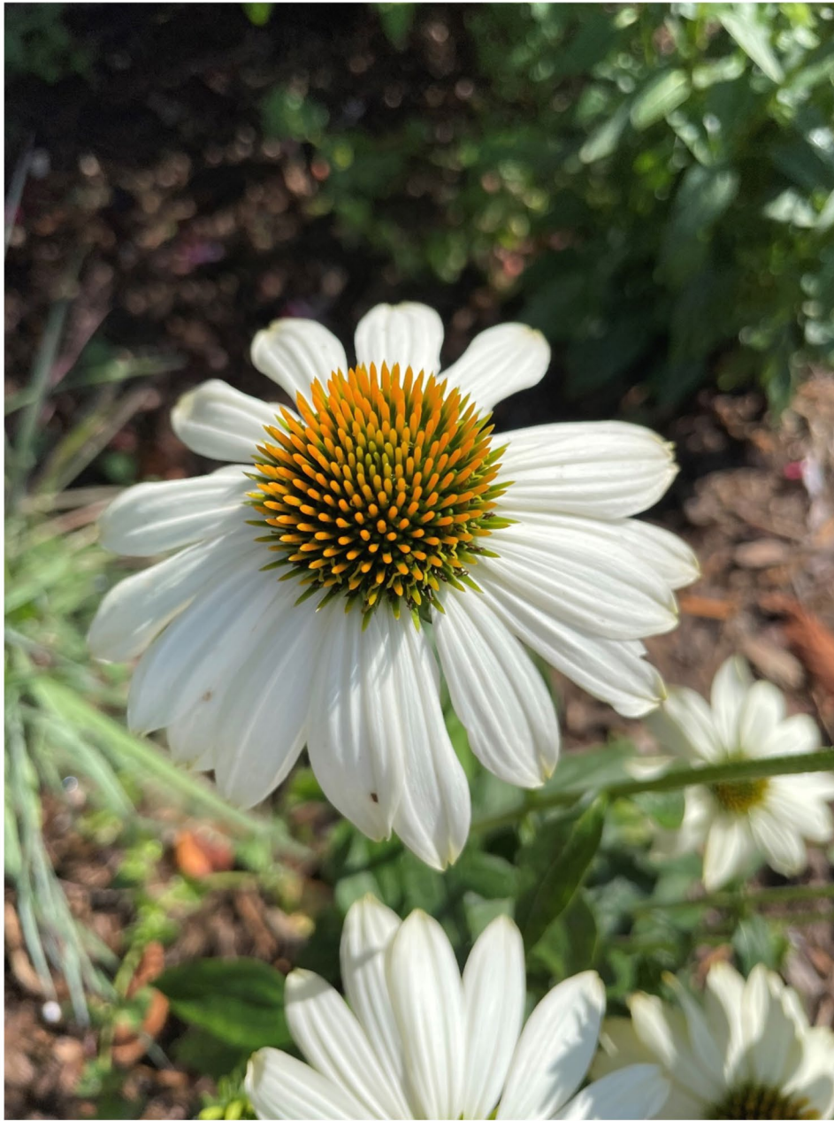
Coneflower 'Pow Wow' in bloom at Rolesville Town Hall

Please contact the Town of Rolesville Planning Department at 919-554-6517 or planning@rolesville.nc.gov for assistance or more information.