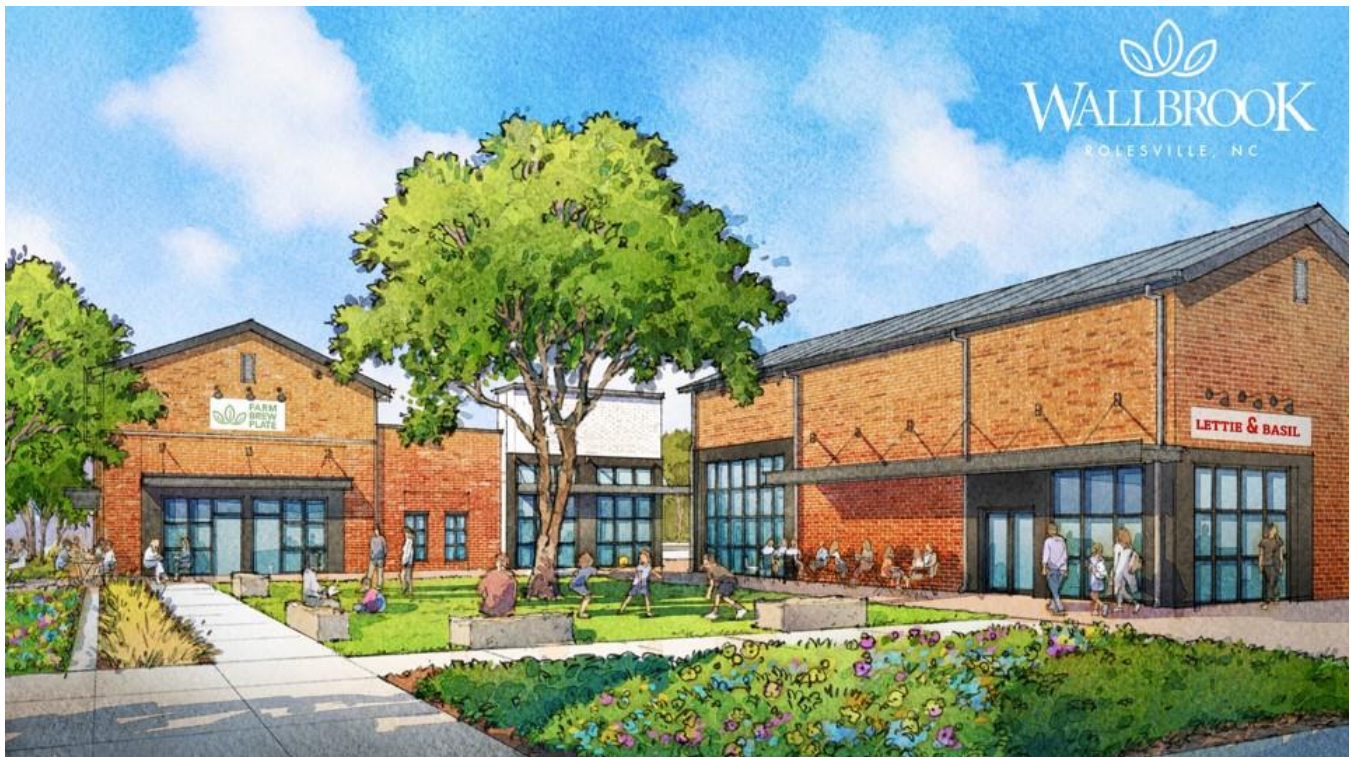
Conceptual Rendering of Future Wallbrook Development

The Town of Rolesville is committed to providing accessible facilities, programs and services for all people in compliance with the Americans with Disabilities Act. Should you need assistance or a particular accommodation please contact the ADA Coordinator.