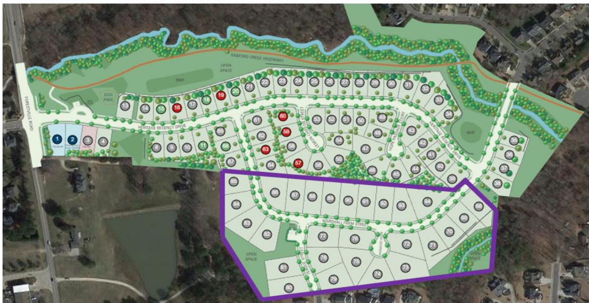
Lots 68-94 outlined in purple are in Rolesville's jurisdiction. Building permits issued.