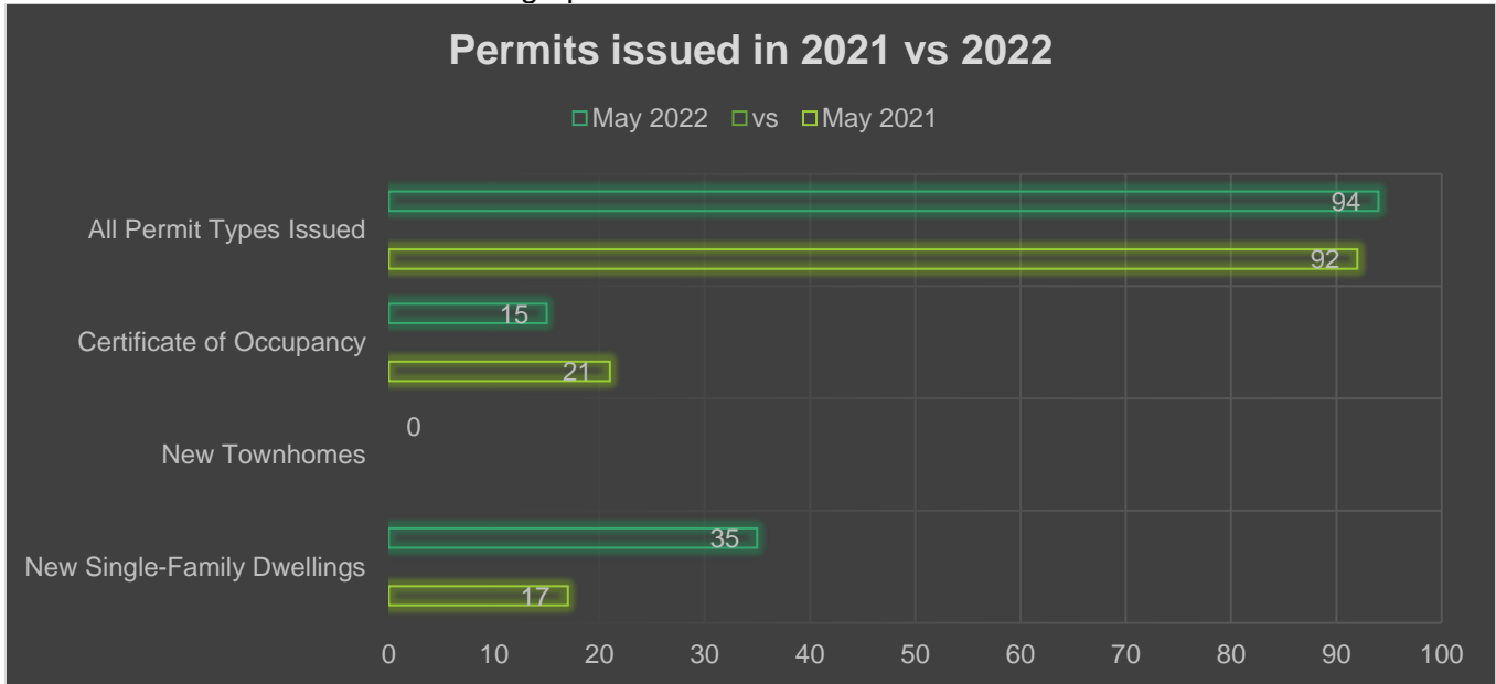
Permits issued in 2021 vs 2022 bar graph.

The Town of Rolesville has experienced an overall increase in permitting activity compared to this time last year.