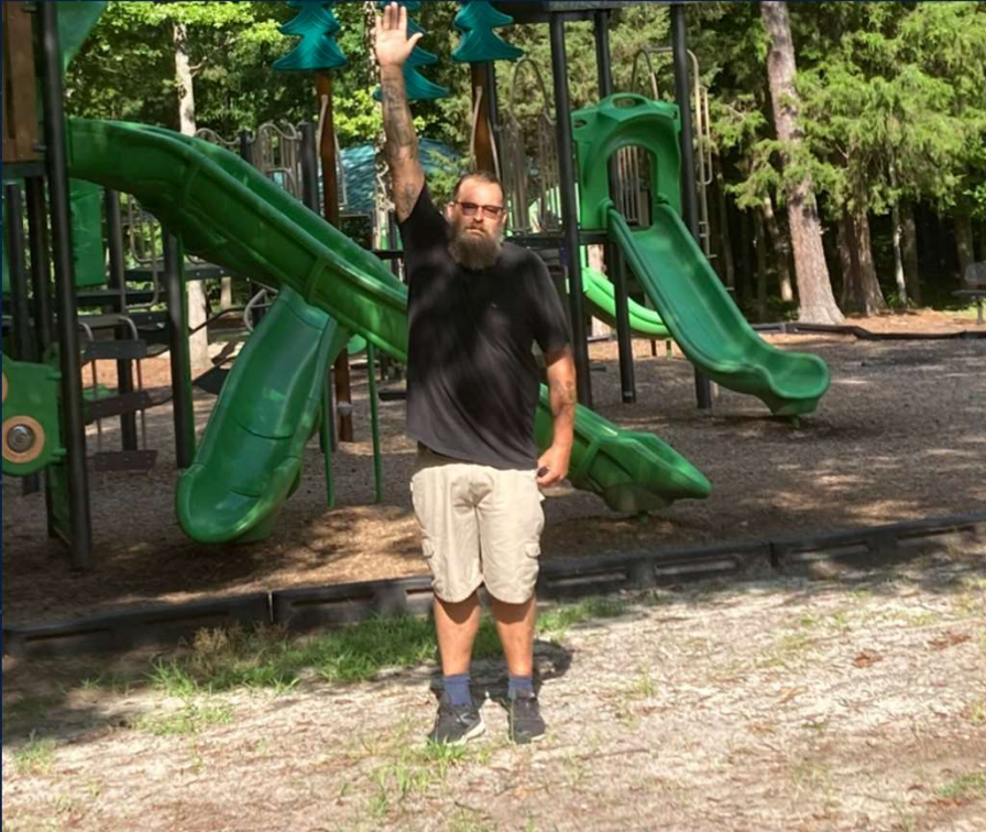
#1 by larger playground