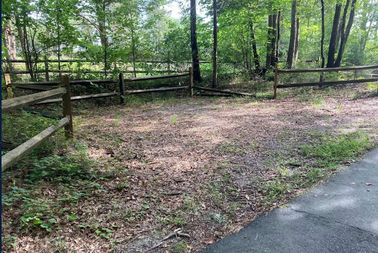
#6 Near Sanford Creek Elementary by the wooden bridge