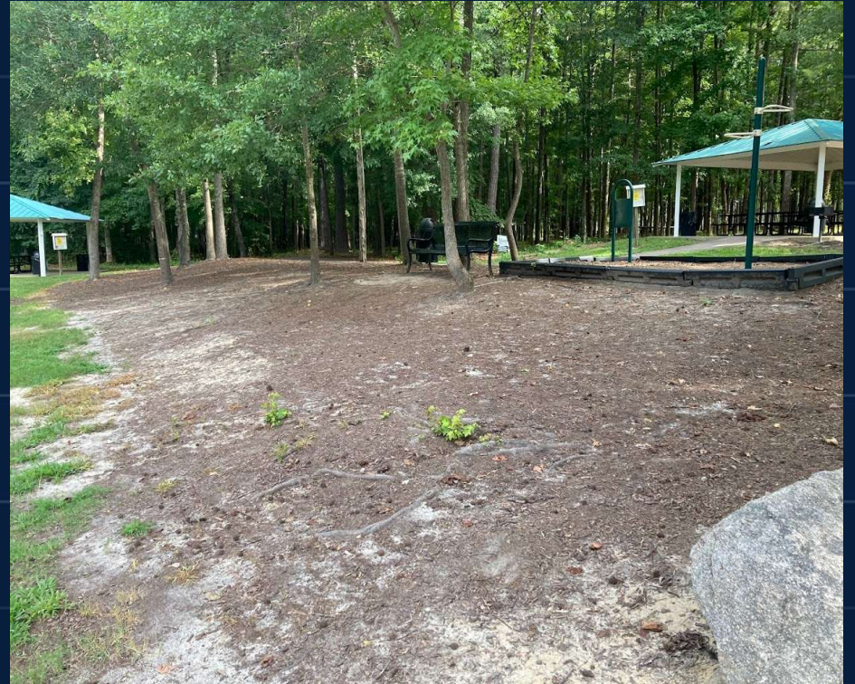
#2 in between two shelters by the main parking lot