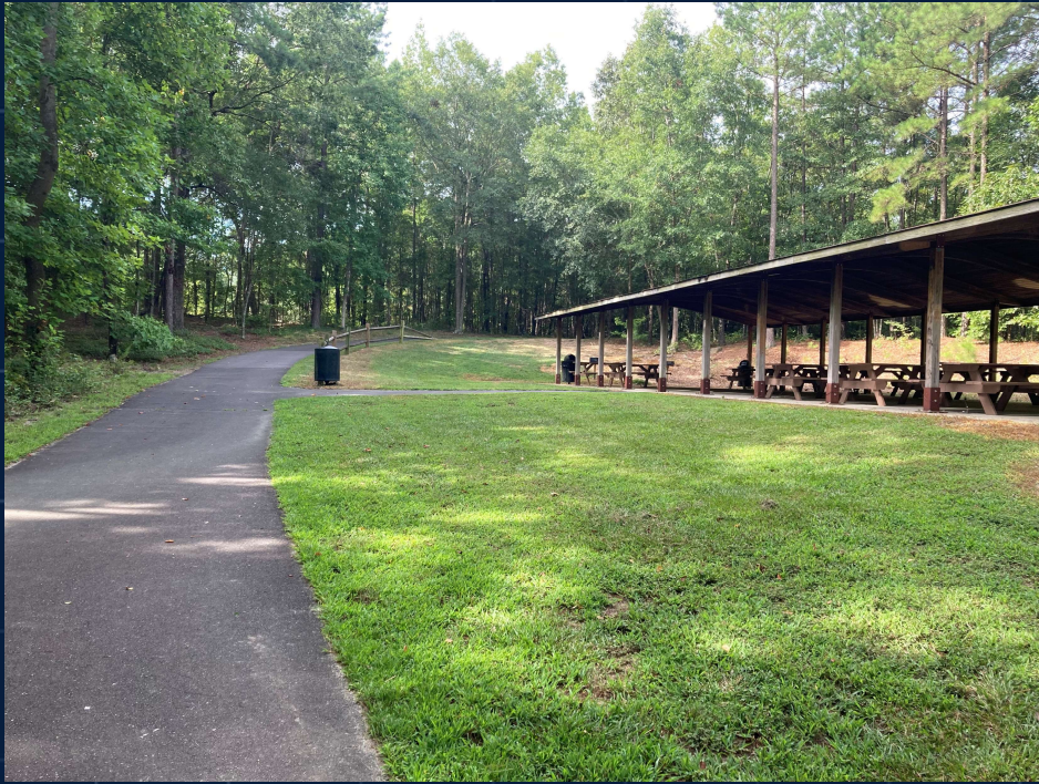
#5 Shelter "D"