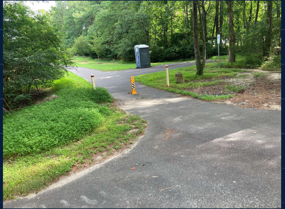
#5 entrance by Shelter "D"