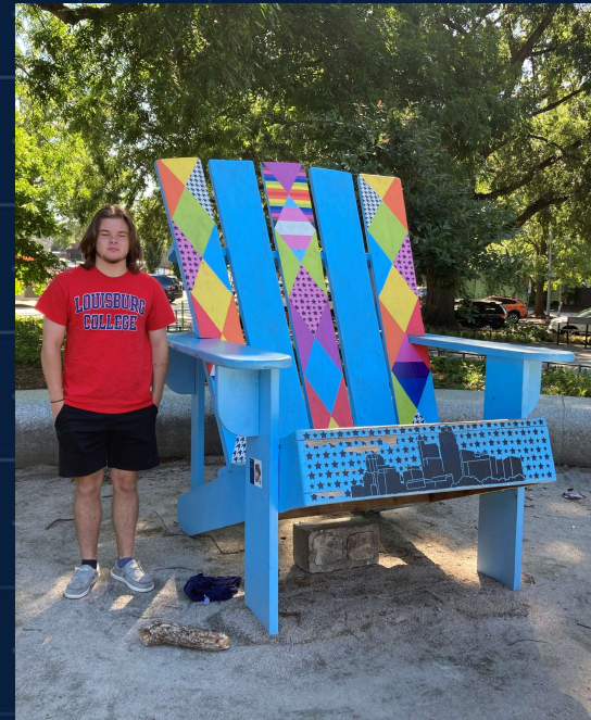
Moore Square, Downtown Raleigh