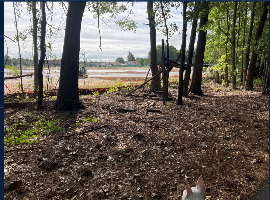
#7 a little further towards the front of the park along Cobblestone border