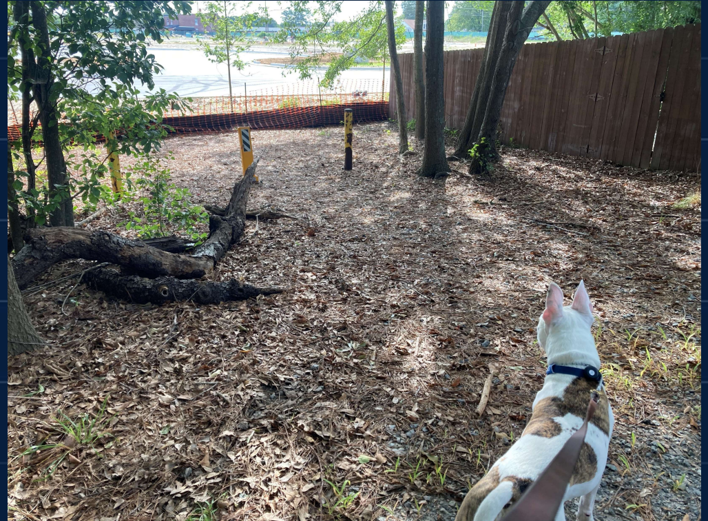
#3 at the old secondary parking entrance