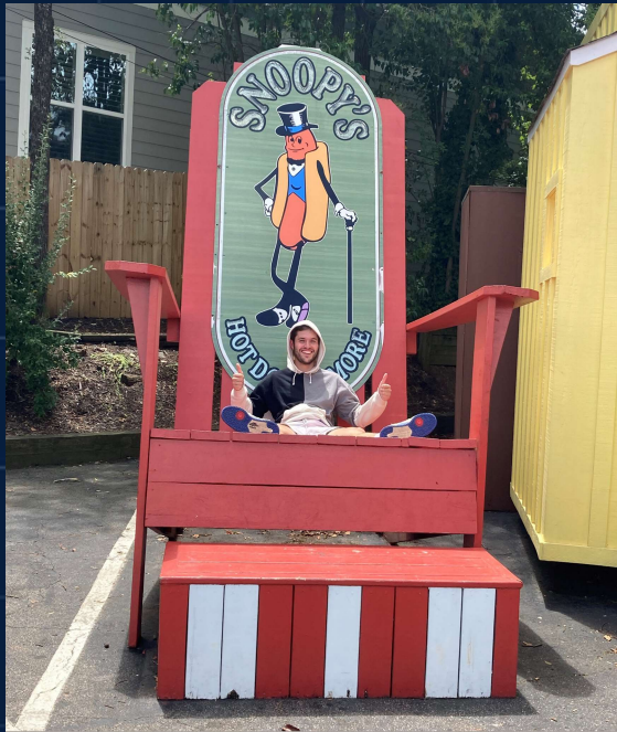
Snoopy's, Wake Forest Road