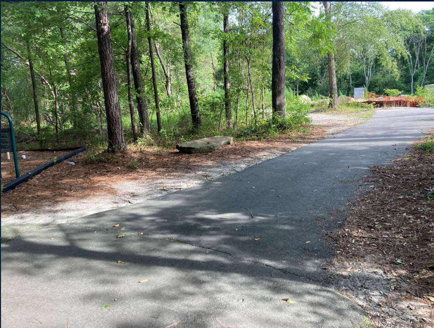
#7 Estimated lower entranceway to Cobblestone by “pushup bar”