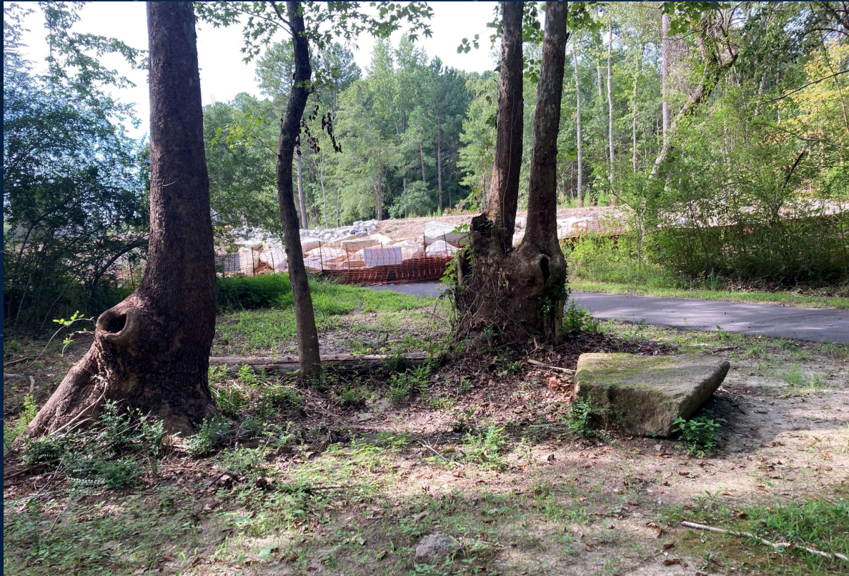
#4 where Trail "A" is cut off by Cobblestone