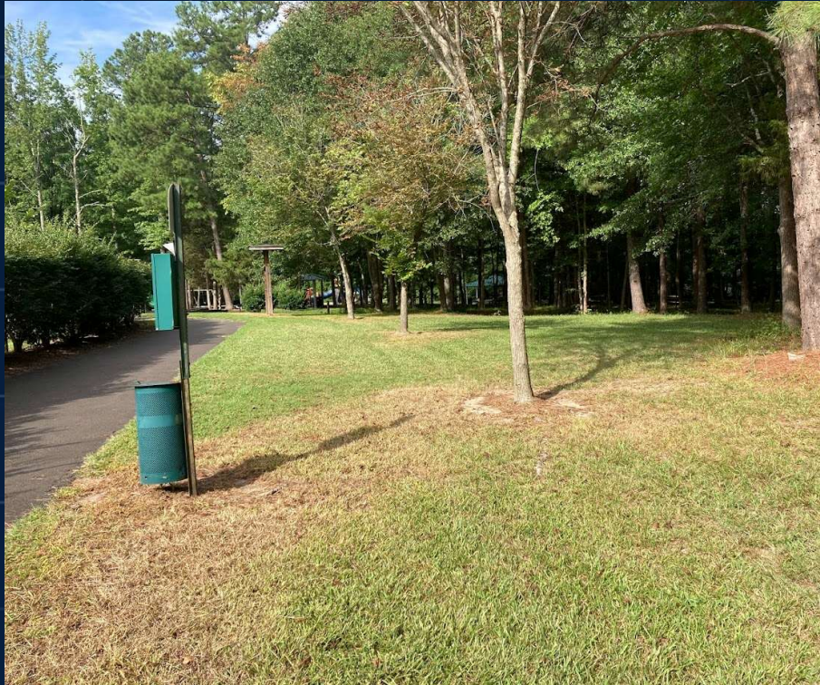
#3 between playground and Cobblestone