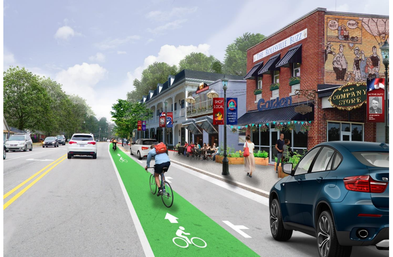
Image from Main Street Vision Plan