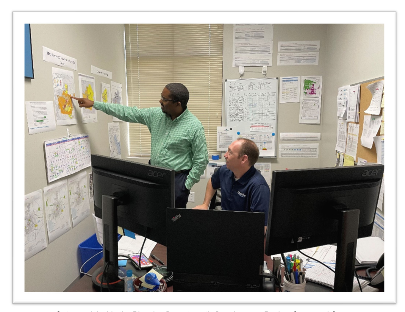
Get a peek inside the Planning Department's Development Review Command Center

The Town of Rolesville is committed to providing accessible facilities, programs, and services for all people in compliance with the Americans with Disabilities Act. Should you need assistance, or a particular accommodation please contact the ADA Coordinator.