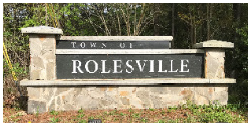
Existing Gateway Sign A, located on Hwy 401