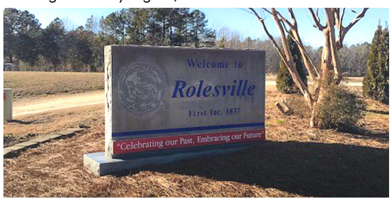
Existing Gateway Sign B, located on N. Main St.